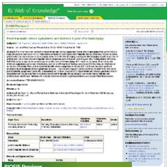
BIOSIS Previews Explore the life sciences via specialized search fields.

The comprehensive source for life sciences and biomedical research from journals, meetings, books, and patents. BIOSIS Previews combines journal content from Biological Abstracts with supplemental, non-journal content from Biological Abstracts /RRM ® (Reports, Reviews, Meetings). Easily access literature in pre-clinical and experimental research, methods and instrumentation, animal studies, environmental and consumer issues, and other areas.