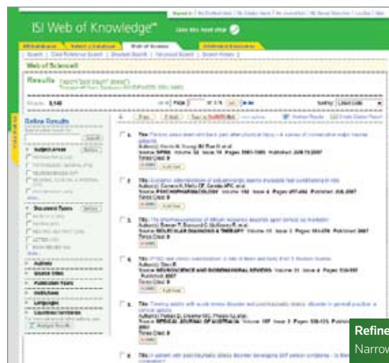
Refine Results Narrow down your results using categories meaningful to your search.